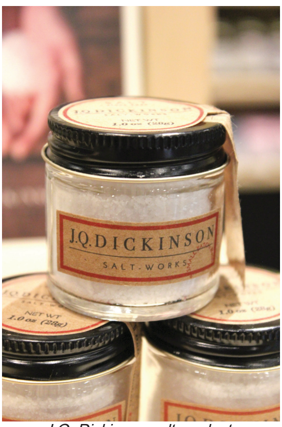
J.Q. Dickinson salt products

The State Museum Gift Shop, located inside the Culture Center, is open Monday - Saturday 9 a.m. to 5 p.m. and is closed on Sundays. For more information, call the State M