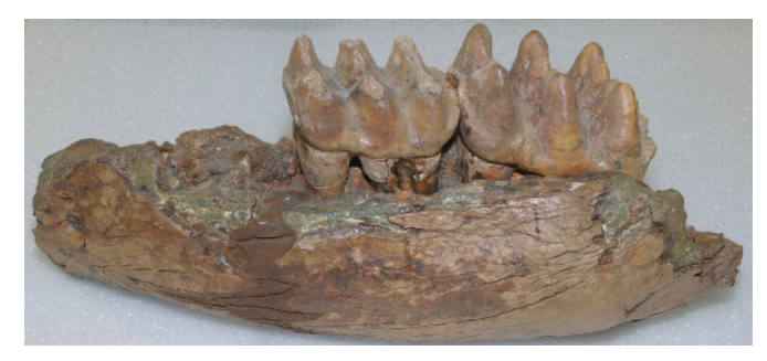
Mastadon jaw found near St. Albans

I would like to personally thank you for the tremendous support and many donations that makes the West Virginia State Museum one of the top attractions in the world.