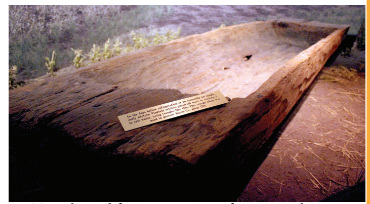
Trough used for preservation of meat in salt water

The West Virginia State Museum has a large wooden trough on exhibition that was made from a tree trunk. The trough was used to soak cuts of meat in a salt solution (brine) before being stored in watertight oak barrels. Readers of 18th-century naval fiction often see references about sailors eating boiled meat which had been preserved in barrels filled with salt. A contractor slaughtered livestock, salted the meat, packed it in watertight barrels and sold it to the Navy and private merchant ships. The sailors also ate hard-tack, dried peas and beans with their boiled meat.